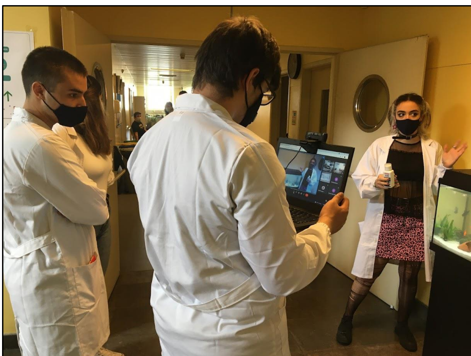
Workshop: Monitoring water quality in an aquarium