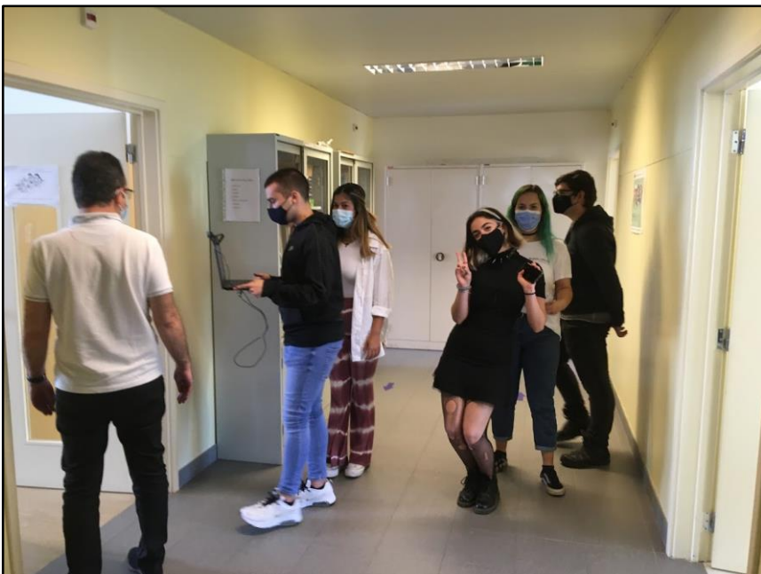
Virtual school tour on the first day