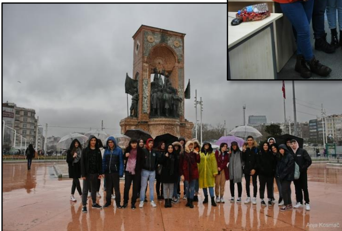
Visiting Istanbul: Taksim square