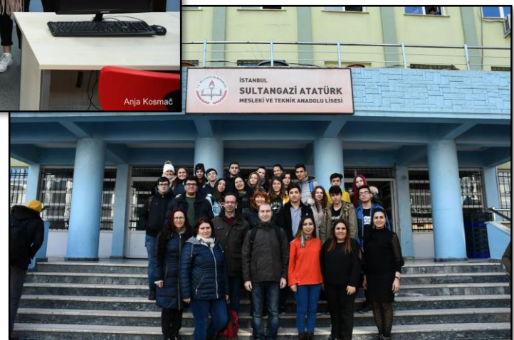
The host school