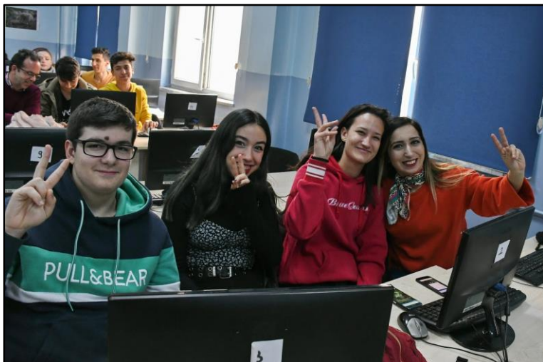
Enjoying our work