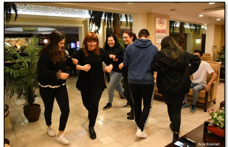
Teaching how to dance "O Vira"